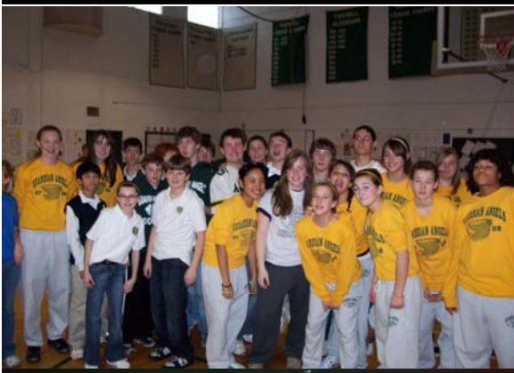
8th Graders battle the Faculty in Volleyball and win for the first time in 3 years