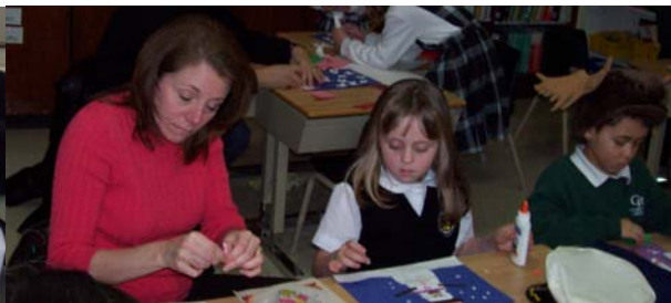
VIPs were welcomed by our students on Tuesday