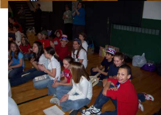
Talent Show 2008