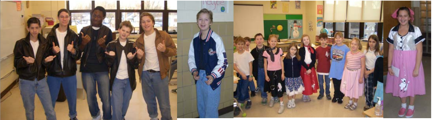
Rock N Roll into Catholic Schools week by wearing clothes for the 50's