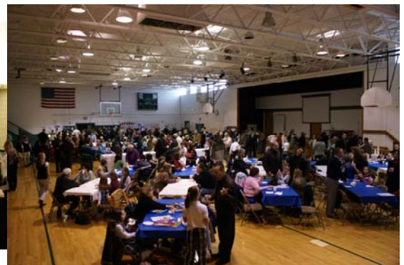
Our choir sang beautifully during Mass and afterward we enjoyed donuts in the gym.