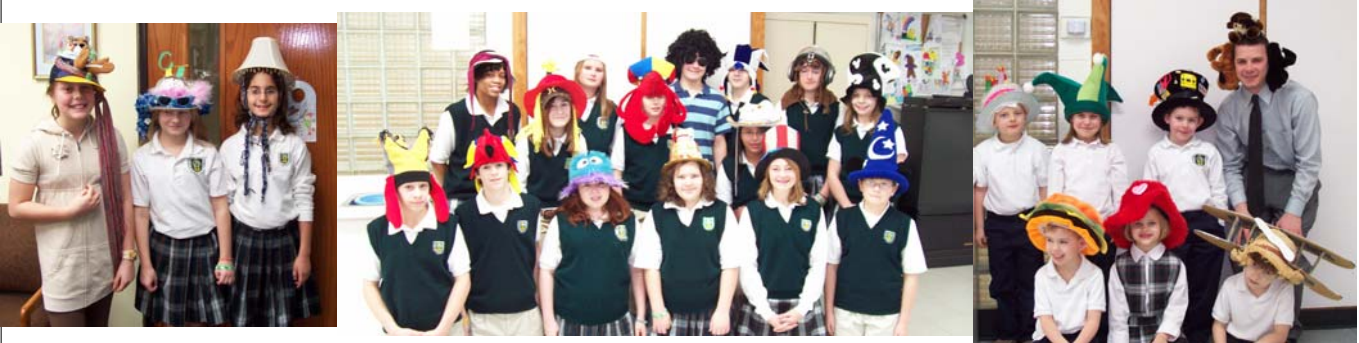
Look at all those crazy hats!